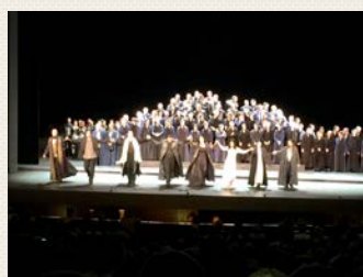
Verdi's Nabucco at the Palau de Les Arts Reina Sofia in Valencia.