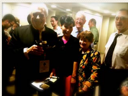
Cocktail after the performance of Verdi's I due Foscari Plácido Domingo with our group at the Grand Teatre del Liceu in Barcelona.