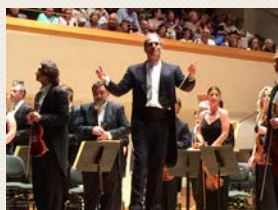
Orquesta de Valencia with maestro Yaron Traub.