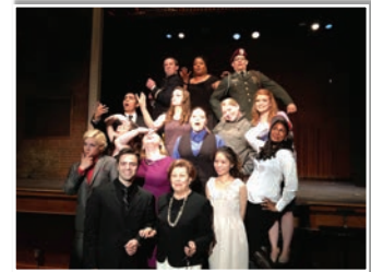
OPERA WORKSHOP AT CUA