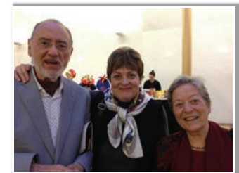
OPERA LAFAYETTE'S ACTÉON