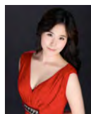
Soprano Yeji Yoon