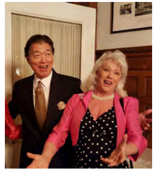
We could have sung all night! 🎵🎵🎵🎵🎵🎵🎵🎵🎵